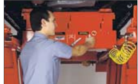
Power Jack 133-63-1 4,500-lb. (2041-kg) Capacity