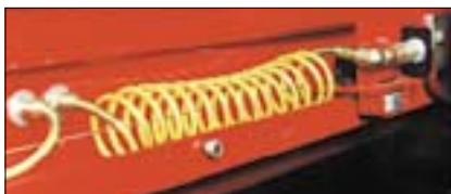
Air Line Kit, 20-794-1 Provides an air source at the front and rear for jacks and air tools.