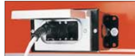
Communications Interface Kit, 20-593-1